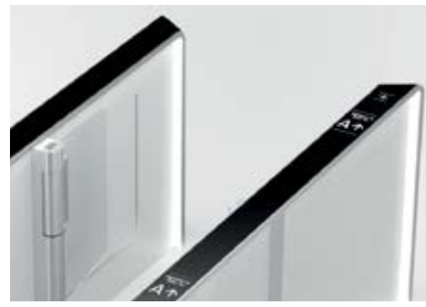
LED strips in combination with displays on top of housing panel, provide walkway lightening and clear directional quidance.