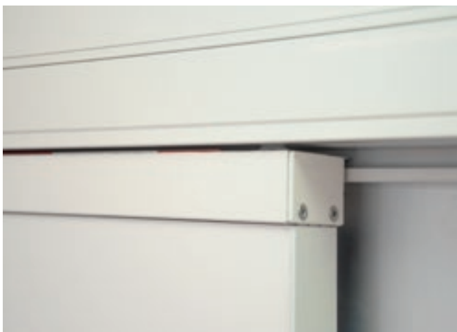
Top door leaf connected to operator