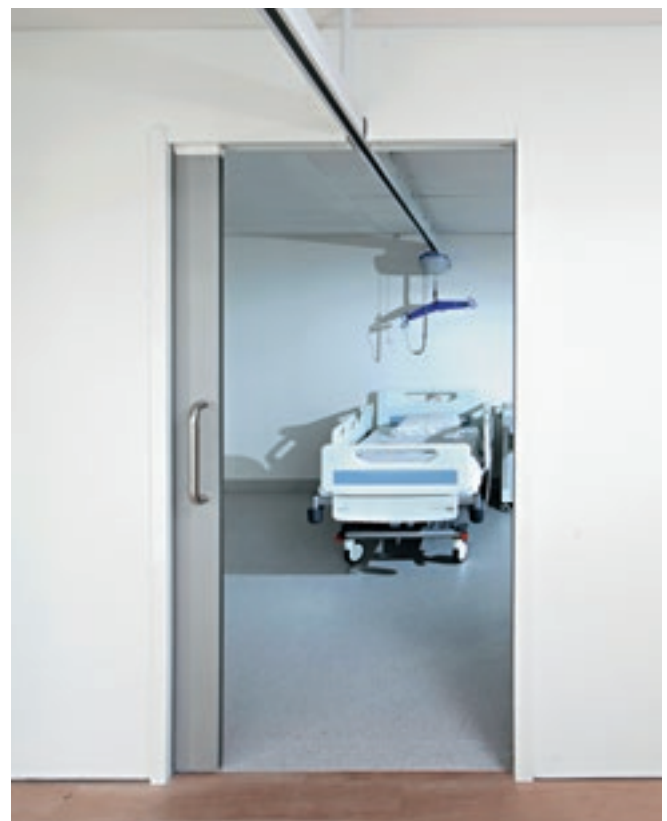
KONE manual gliding door integrated with a patient lifting system