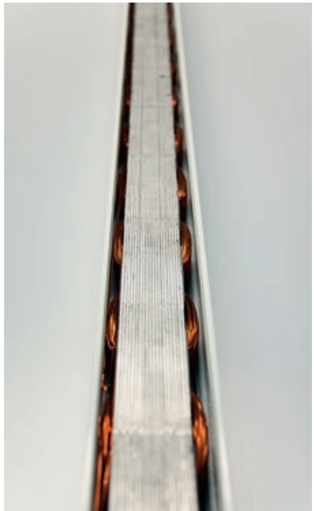
Linear motor inside operator