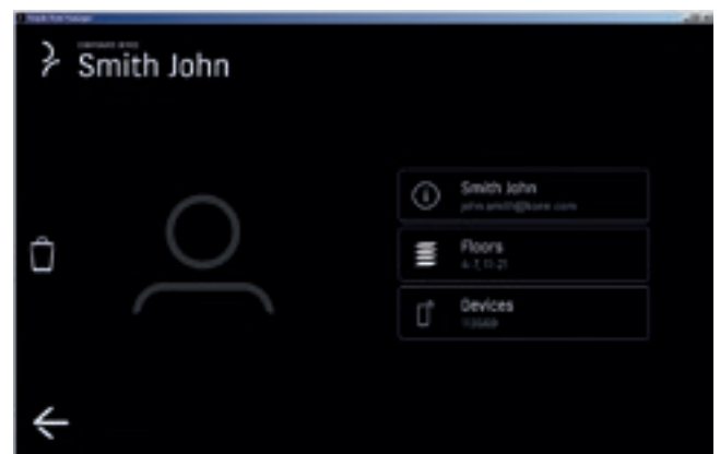
User information screen