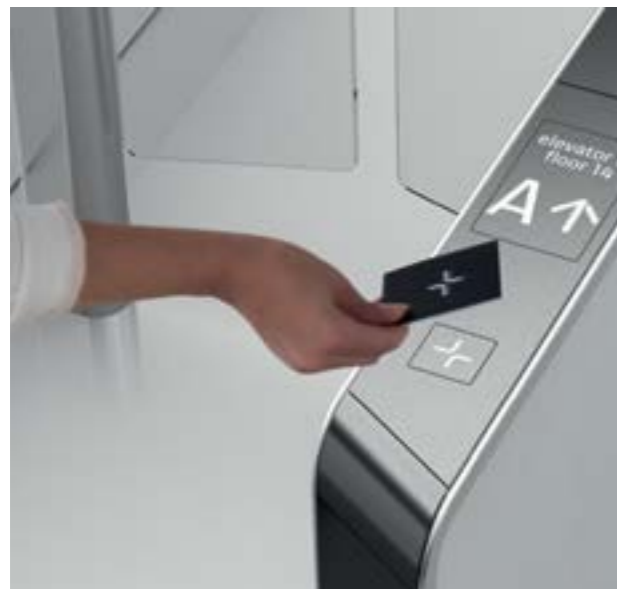
Content of card is detected by the reader which after recognition, activation pass is indicated while giving directional guidance.

In modern buildings, turnstiles are increasingly becoming an integral part of the people flow process. They are used to provide quick and comfortable access, guide people in the right direction, and even to verify access rights through integrated card readers. And because they are usually the first thing people see after entering the lobby, the ability to customize the visual appearance to match the surrounding architecture is also an important consideration.