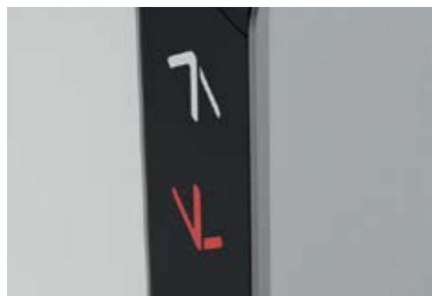
Clear illuminating arrows in front of the panel indicate access or no access passage when reader is recognized.