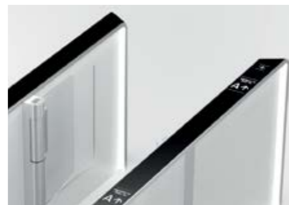
LED strips in combination with displays on top of housing panel, provide walkway lightening and clear directional guidance.